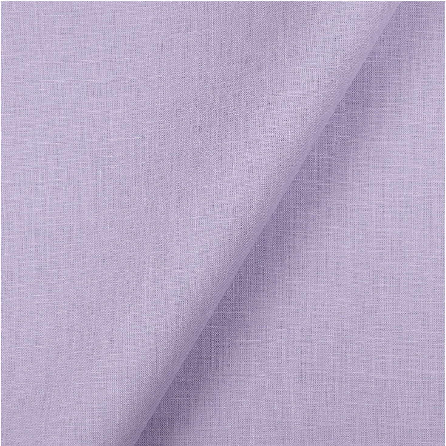
FS LILAC SILVER Softened 100% Linen

Perry sought out Monet in his wild home at Giverny and the pair forged a lifelong friendship founded on a mutual passion for Impressionist en plein air painting. Even after returning to live in Boston with her family, Perry returned again and again in the Summer months to stay in Giverny near Monet's